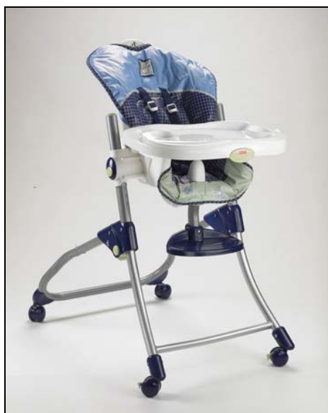
Close to Me™ High Chair