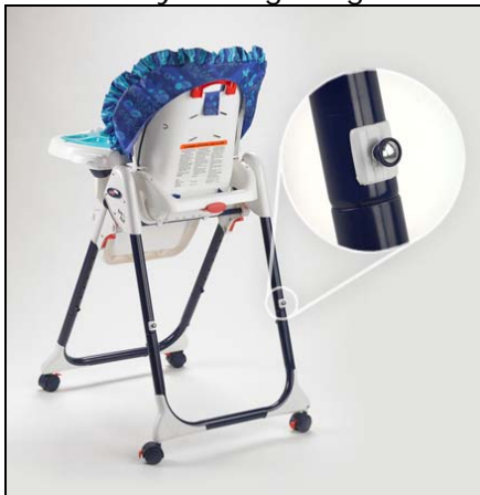
Healthy Care™ High Chair With Tray Storage Peg