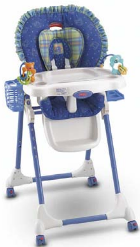
Healthy Care™ High Chair