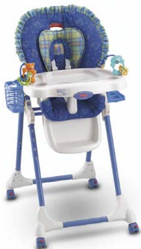
Healthy Care™ High Chair