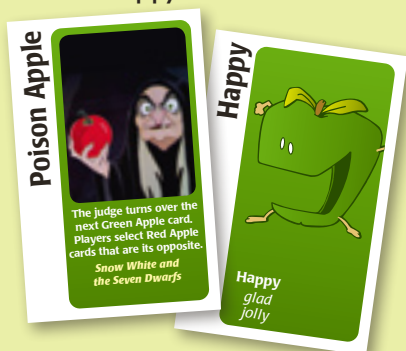
The Poison Apple card transforms “Happy” into “Sad”