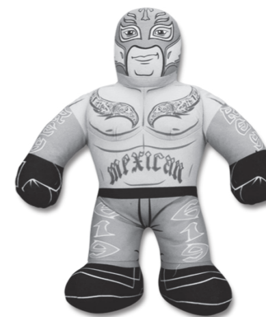
REY MYSTERIO® W8016