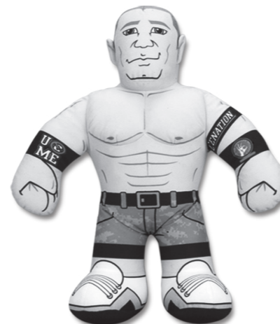
JOHN CENA® W8015