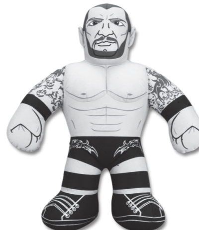
RANDY ORTON™ W8017