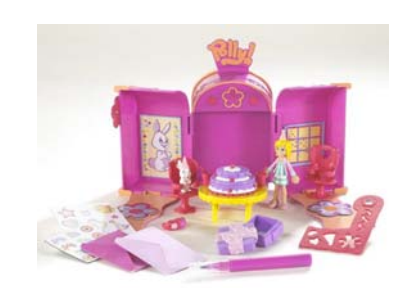
B7126 – Polly Birthday Mailbox Purple (B7127, C0504)