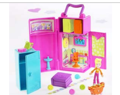
B3202 – School Time Fun<sup>™</sup> pink (B3204)