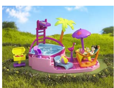
B7123 – Dip N' Dive Pool™ (B3210)