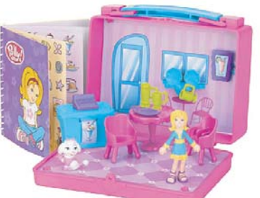
B3202 – Activity Lunchbox Cafe™ - Pink (B9522)