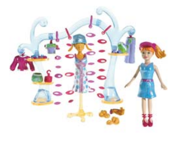
G8606 –QUIK-CLIK™ SPORTY STYLE™ Playset (LEA™) (H1538)