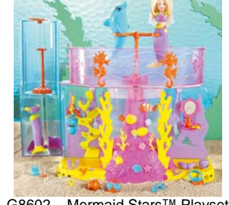
G8602 – Mermaid Stars™ Playset