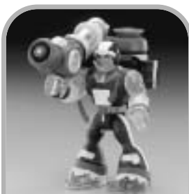
Hydro Team™ Bob Buoy™ Coast Guard 78376