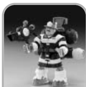
Hydro Team™ Billy Blazes™ Firefighter 78374