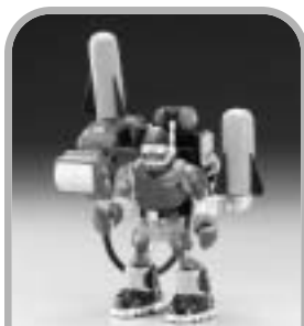
Flight Team™ Rocky Canyon™ Mountain Ranger 78379