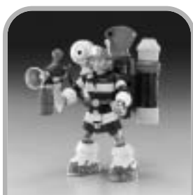
Hydro Team™ Wendy Waters™ Firefighter 78375