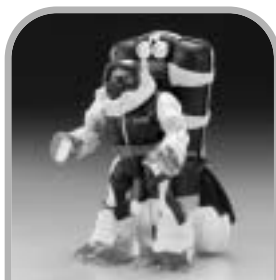
Hydro Team™ Gil Gripper™ Scuba Diver 78378