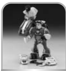
Flight Team™ Perry Chute™ Rescue Pilot 78382