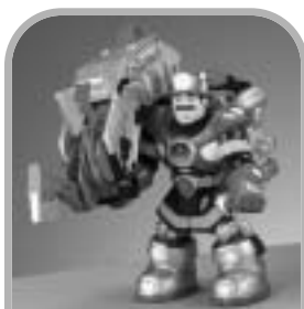
PowerMax™ Billy Blazes™ Firefighter 78369

Each sold separately and subject to availability.