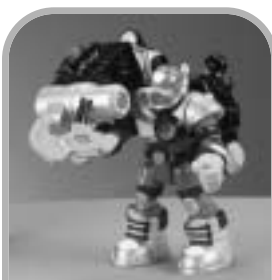
PowerMax™ Rocky Canyon™ Mountain Hero 78371