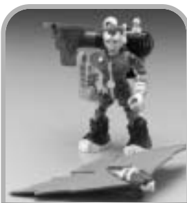
Flight Team™ Ariel Flyer™ Pilot & Veterinarian 78380