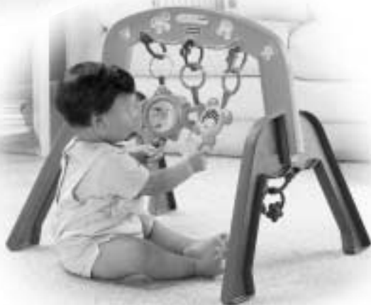
Sit & Play

Please keep this instruction sheet for future reference, as it contains important information.