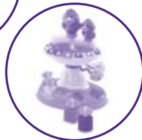
Learning Birdbath™ C6513

For countries outside the United States: