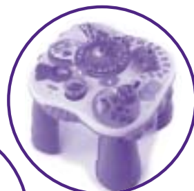
Learning Table™ C5522