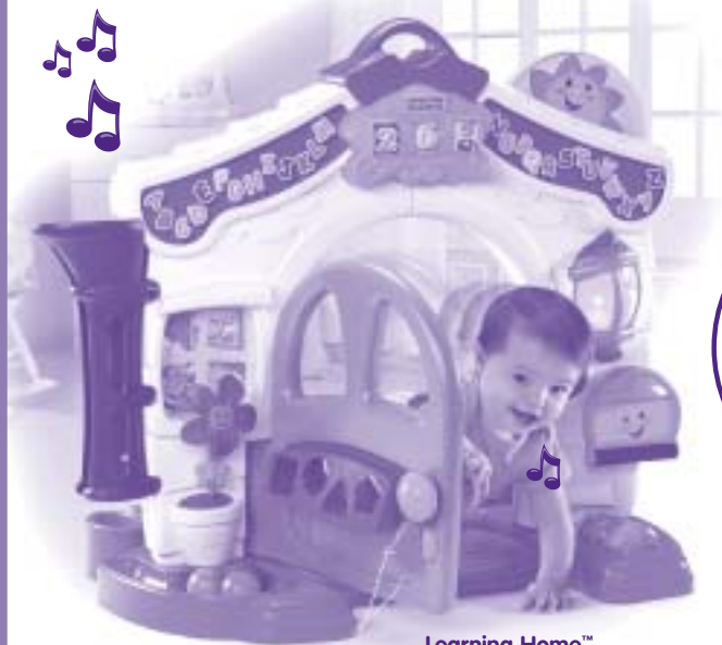
Learning Home™ C6327

Collect all these Laugh & Learn™ toys. Each has a special place in the Learning Home!