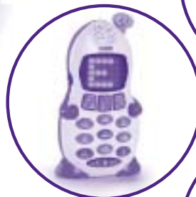
Learning Phone™ C6324