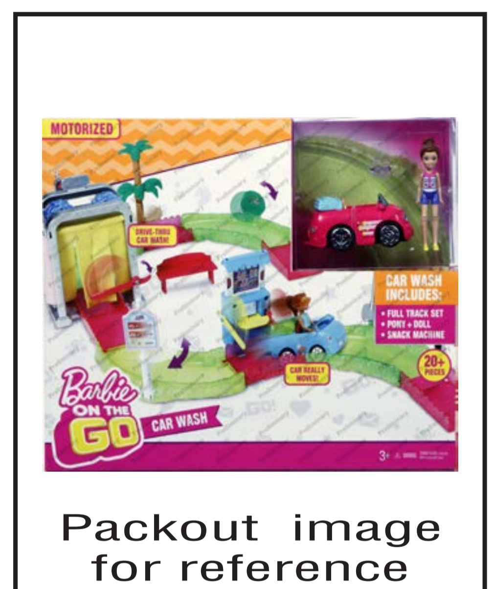
Packout image for reference

CONFORMS TO THE SAFETY REQUIREMENTS OF ASTM F963 ©2017 Mattel. All Rights Reserved. MATTEL, BARBIE and related trademarks and trade dress are owned by Mattel. "On The Go" is a trademark of Mattel, except as noted. MADE IN CHINA. Consumer Service: Mattel, Inc., 456 Grand Avenue, East Aurora, NY 14052, U.S.A. 1-800-524-9007. Mattel Australia Pty. Ltd., Richmond, Victoria, 3121. Consumer Helpline: 1-800-735-3733. Mattel East Asia Ltd., Room 502-05 North Tower, World Finance Centre, Harbour City, Hong Kong, HK, China, Tel: (852) 3183-6500. Singapore: S. Distribution (Singapore) Pte. Ltd., No. 10-1, Tower 1, Avenue 7, Singapore South City, No. 8, Jalan Kerinci, 93000 Kuala Lumpur, Malaysia. Tel: (6) 3-2803817. Fax: (6) 3-2803807. Mattel South Africa (Pty) Ltd., Office 102 (L), 30 Motore Road, Johannesburg 2196. Manufactured for and imported into the EU by Mattel Europe B.V., Goedge 1, 1116 AB Amstelveen, Netherlands. Additionally distributed in the EU by Mattel U.K. Ltd., Fernhill Business Park, Maidenhead SL6 4UB, telephone 01753 500303. CONSUMER INFORMATION Need Assistance? Visit service.mattel.com or call 1-800-524-9007. SERVICE.MATTEL.COM PROOF OF PURCHASE Barcode: 8 999614530001