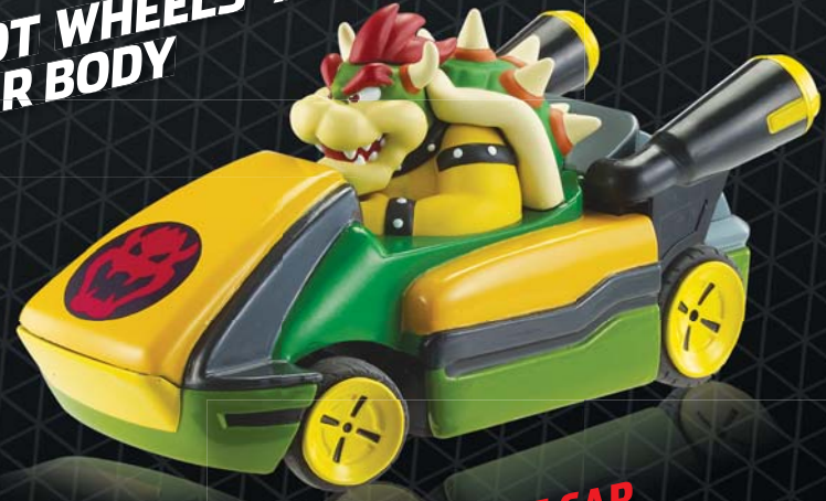
BOWSER™ SMART CAR