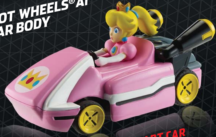
PRINCESS PEACH™ SMART CAR