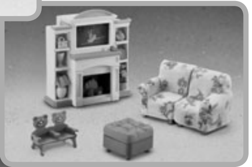
Family Room J8998