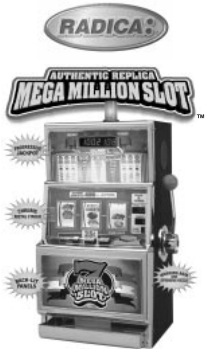
Model 2700 P/N 82350300 Rev.A For 1 Player / Ages 18 and Up

This is not a toy and is intended for use by or under the supervision of adults.