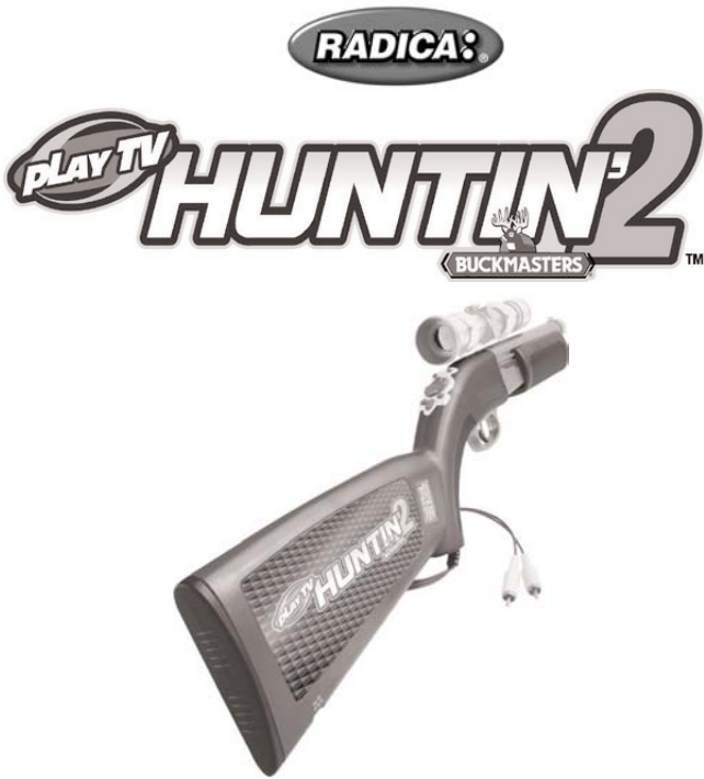
Model G73030 For 1 player / Ages 8 and up INSTRUCTION MANUAL P/N Rev.A

With Radica Play TV Buckmasters Huntin'™ 2 you can travel to some of the finest hunting spots in the world, all from the comfort of your own home! Whether your tracking deer through the Colorado Rockies or Canada's Yukon, there's no finer way to hone your tracking and hunting skills! And if you need more practice, why not stop by the Target Range for a few rounds? You can even visit the Trophy Room to see who's bagged the top trophy. Good huntin' and good luck!