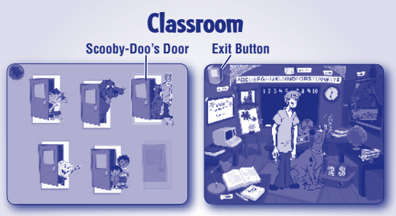
Software Selection Screen