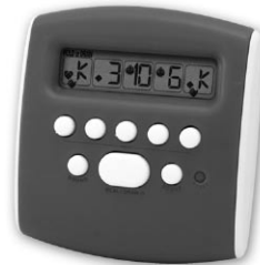
Asst. N7315 N6056