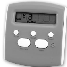
Asst. N7315 N6057