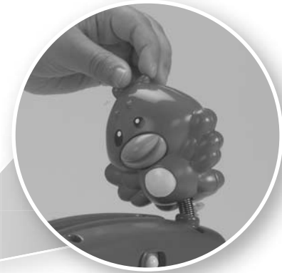
Bat the bird