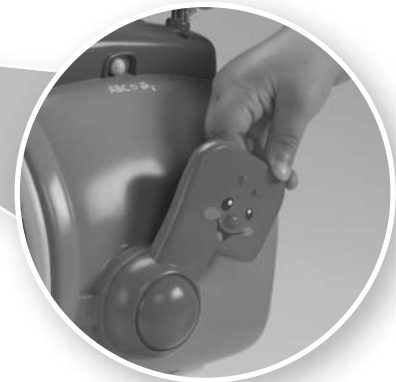
Lift and lower the flag