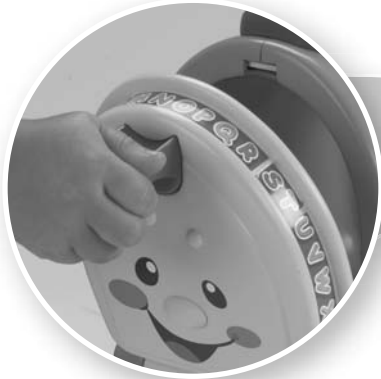
Open and close the mailbox