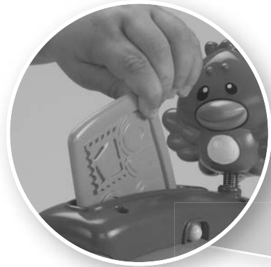
Drop letters into the slot