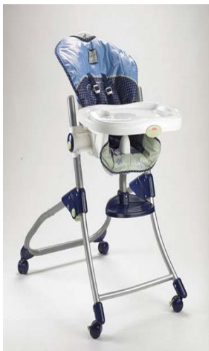
Close to Me™ High Chair