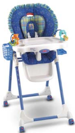
Healthy Care™ High Chair