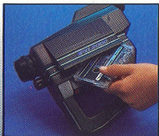
1. Load audio cassette.