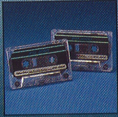
3325 Tape Twin Pack

©1987 Fisher-Price Division of The Quaker Oats Company East Aurora, NY 14052 Printed in U.S.A. Product specifications subject to change