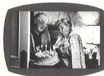
Fun with family