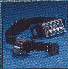
3321 Action Strap