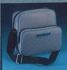
3320 Carrying Case

Includes: PXL 2000 Camcorder, 4.5" black & white TV with A.C. adaptor, TV hook-up accessories, One high bias cassette tape, Mini bipod stand, 6 AA Duracell® batteries, Instruction booklet