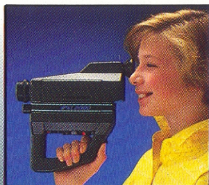
3. Take aim and shoot.