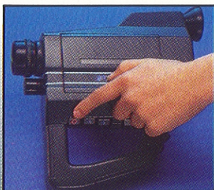
2. Press record button.