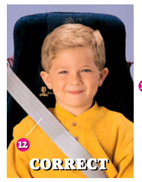
😰 The vehicle shoulder belt should be over your child's shoulder.