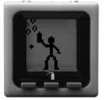
Dusty - Buzz Off

MOTION SENSORS - Play with and pester each STICK MAN™ by shaking or tumbling the cube.