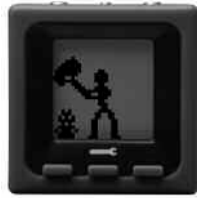
Handy - Go Go Gopher