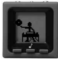
Mic - Spin Off

STICK GAMES™ - Each cube has a unique STICK GAME™.