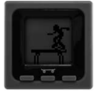
Grinder - Rail Slides

MOTION SENSORS - Play with and pester each STICK MAN™ by shaking or tumbling the cube.