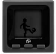
Kicks - Juggling