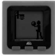
Slam - Jump Shot