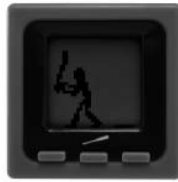
Slugger - Batting Cage