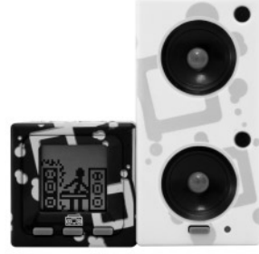
Hip-Hop - Graffiti

ANIMATIONS – Each cube has over 100 animations. Once connected to a modifier, extra animations are unlocked.