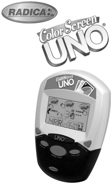
N1870 For 1 player / Ages 7 and up INSTRUCTION MANUAL P/N 823B5700 Rev.A